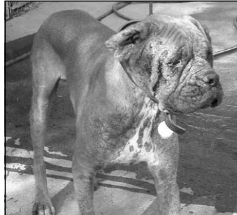
Curing severe mange due to owner neglect: $600