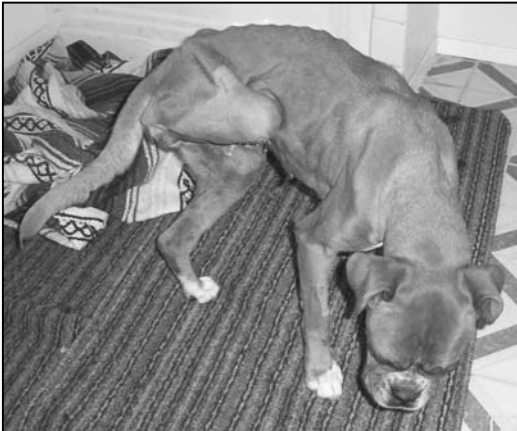
Removing leg and treating injuries from pellet gun: $2,500