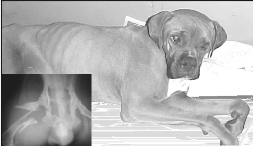
Repairing shattered pelvis and broken legs after being hit by a car: $5,000