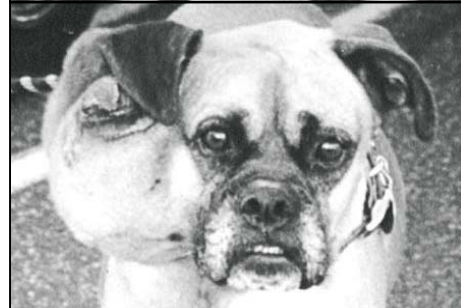
Removing a tumor the size of the dog's head: $1,200