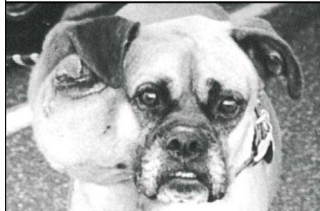
Removing a tumor the size of the dog's head: $1,200