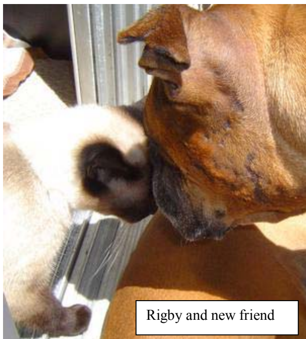
Rigby and new friend

If you think a special needs dog, or a dog in bad shape will be too much work, let me tell you: IT'S WORTH IT! They may not be the picture of obedience and restraint when you visit them at the kennel, but they can become your best friends and true members of the family!