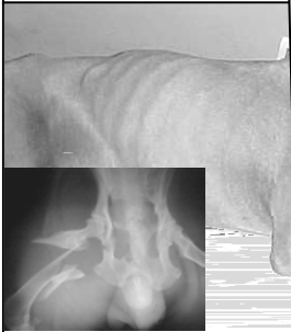
Repairing shattered broken legs after b car: $5,000