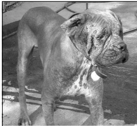
Curing severe mange due to owner neglect: $600