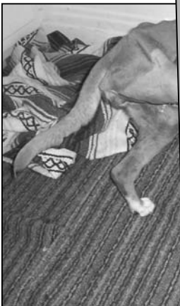
Removing leg and from pellet gun: